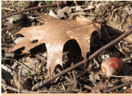
Red Oak leaf and acorn