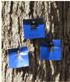
3 blue trail markers