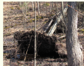
Tipped over tree roots