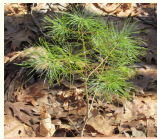
Small pine tree