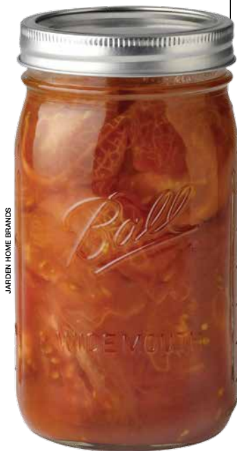
JARDEN HOME BRANDS